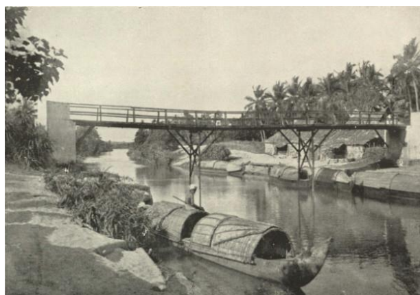
Kettuvallams in a canal in Travancore circa 1905.