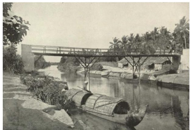
Kettuvallams in a canal in Travancore circa 1905.