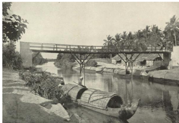
Kettuvallams in a canal in Travancore circa 1905.