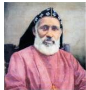
Abraham Mar Thoma XVII Metropolitan