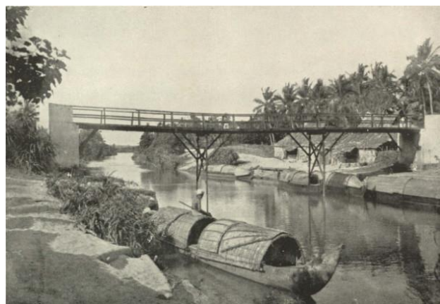
Kettuvallams in a canal in Travancore circa 1905.