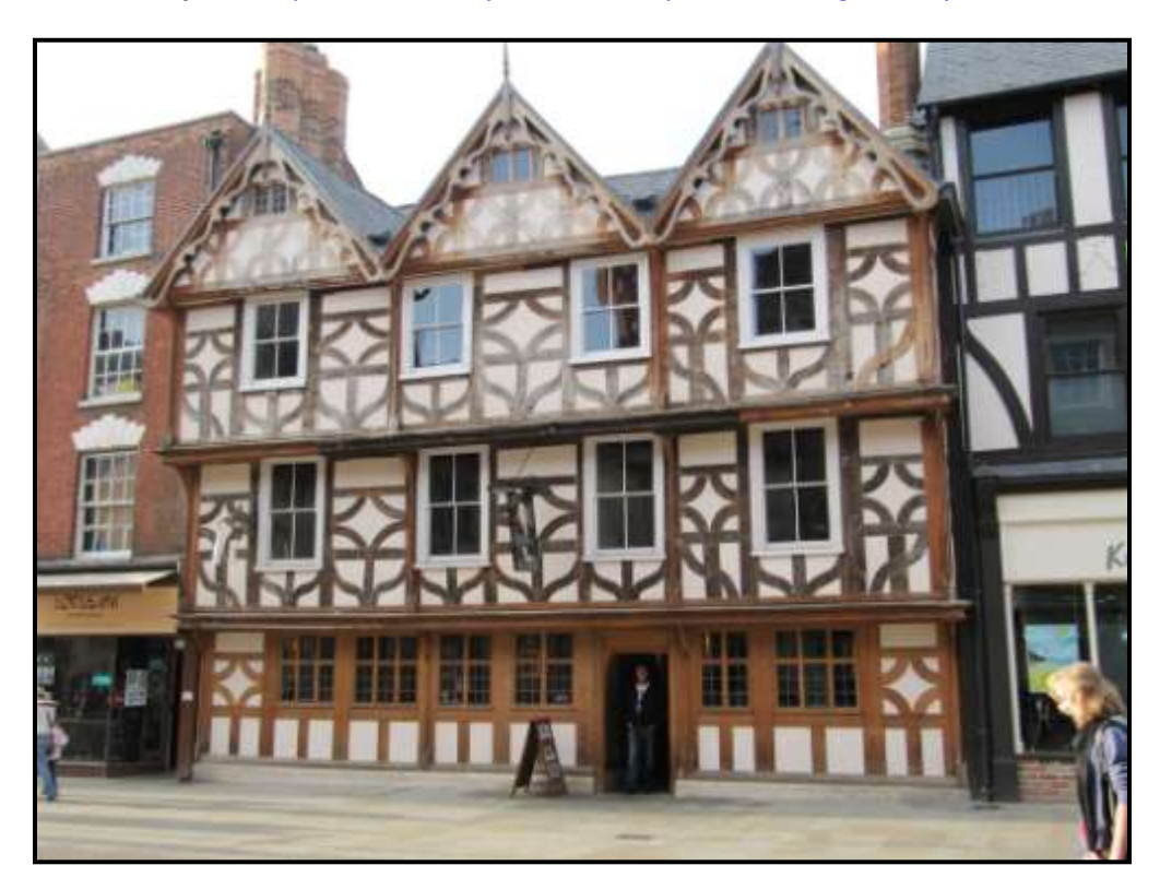
Robert Raikes House, Southgate Street, Gloucester.